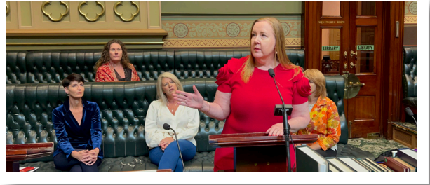
Speaking up to ensure our electorate is represented in Macquarie Street.

In Parliament recently I spoke of just some of the major achievements we have made since I was elected as the Member for Maitland in 2015. Some are still to be completed, and a couple were started before I got here, but I am proud of all of them. Thanks to my Federal and Local Government colleagues for their support on many of these, and thanks to the community for your support!