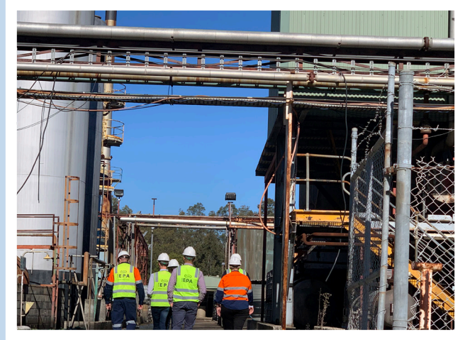
EPA Staff on-site inspecting the toxic dump.

As a result of collective advocacy, the dirty deeds have been exposed, laws have changed, and the site will finally be remediated.